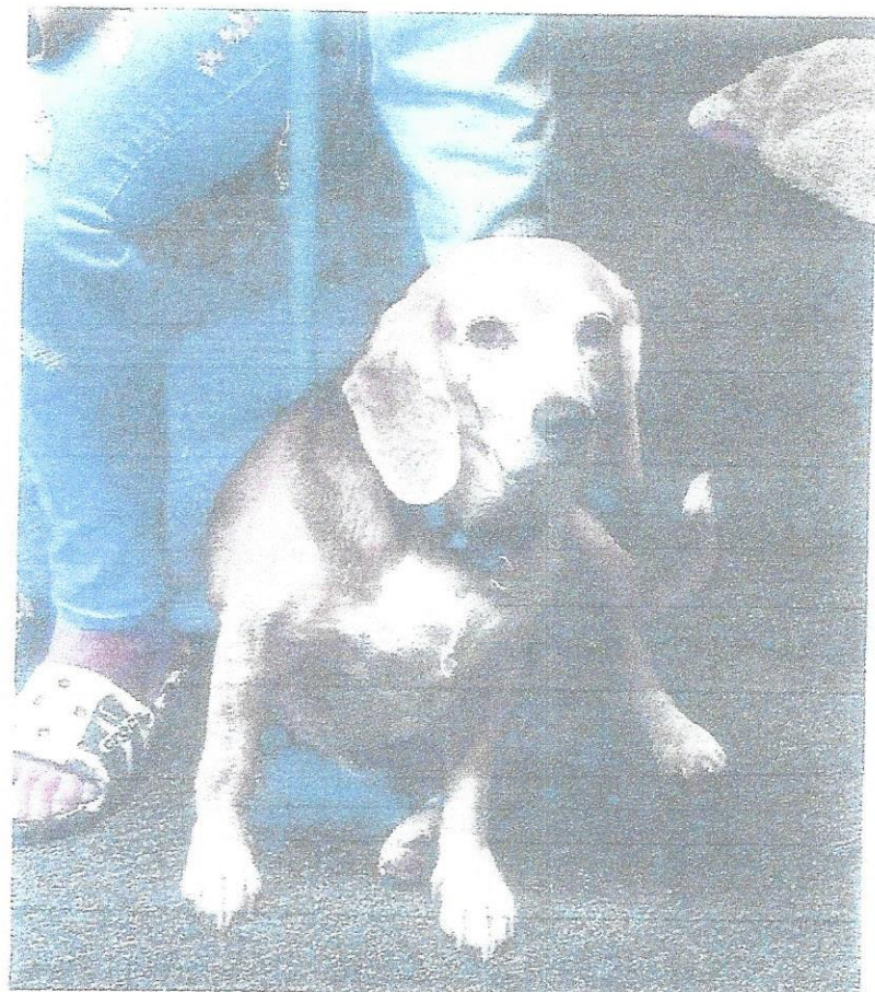
Barney, our therapy dog